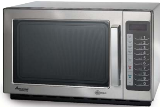
Model RCS10TS shown