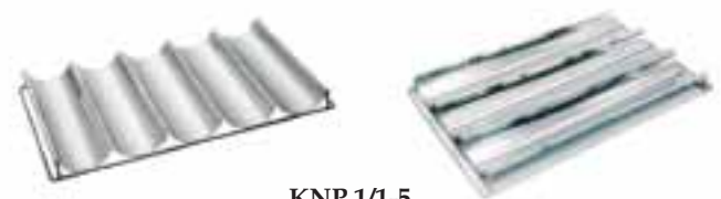
KNP 1/1-5 5 dumplings; 500 gr. each